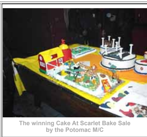
The winning Cake At Scarlet Bake Sale by the Potomac M/C