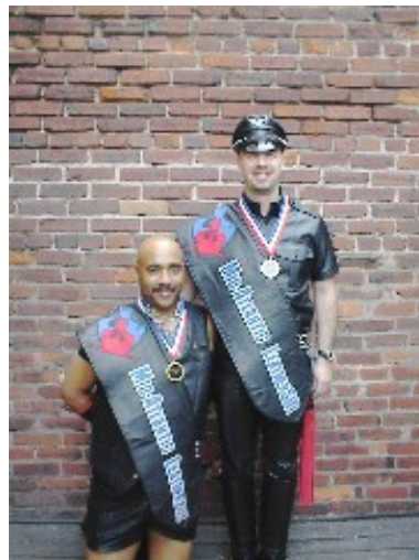
Mid-Atlantic Sir/boy '04/'05