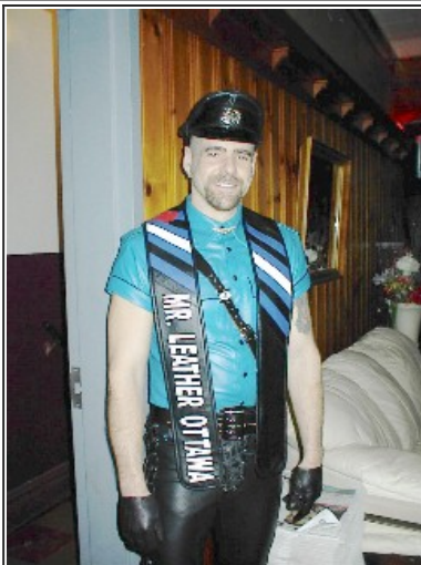
Mr. Ottawa Leather 2004