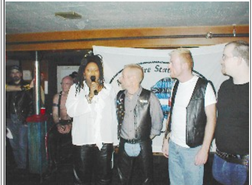
Queen Cougar and Empire State Contestants