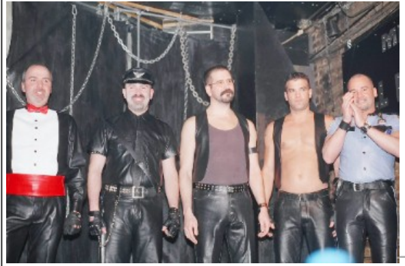
> Mr Cell Block Leather '04 contestants.