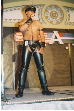
California LeatherMan Master Jammer