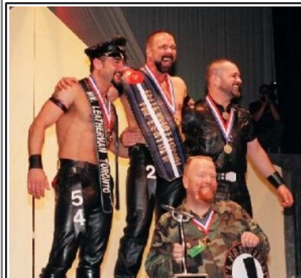
IML Winners '04